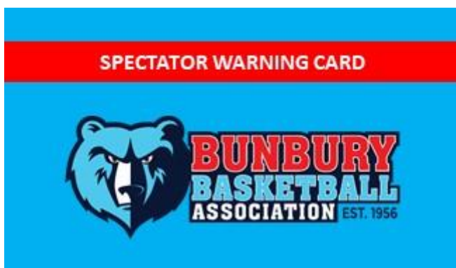
Front image of spectator warning card